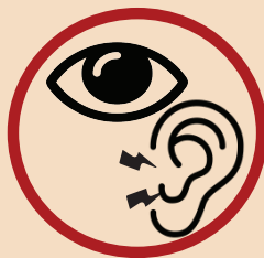
Ear or eye infection